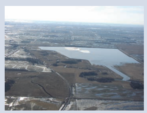
Off Channel Impoundment (Comstock Twp)

the city of Warren which would have compared to the 1997 flood. It is estimated that the project prevented $8.7 million in economic damage to the surrounding area. The backfilling of the Diversion Structure is underway with completion expected this summer.