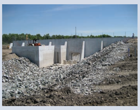
Backside of the Diversion Structure